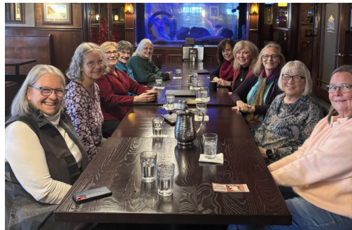
Lunch Bunch members at Blackwoods in December