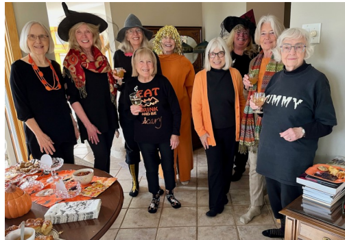
The Film Group celebrates Halloween