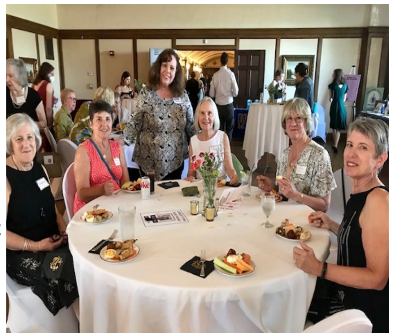
Right: Branch members at the WE Clinic Fund-raiser in August at the Kitchi Gammi Club, Duluth