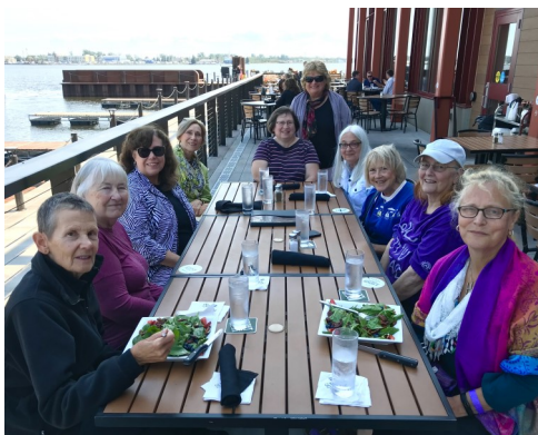
Left: Lunch Bunch members at Pier 1